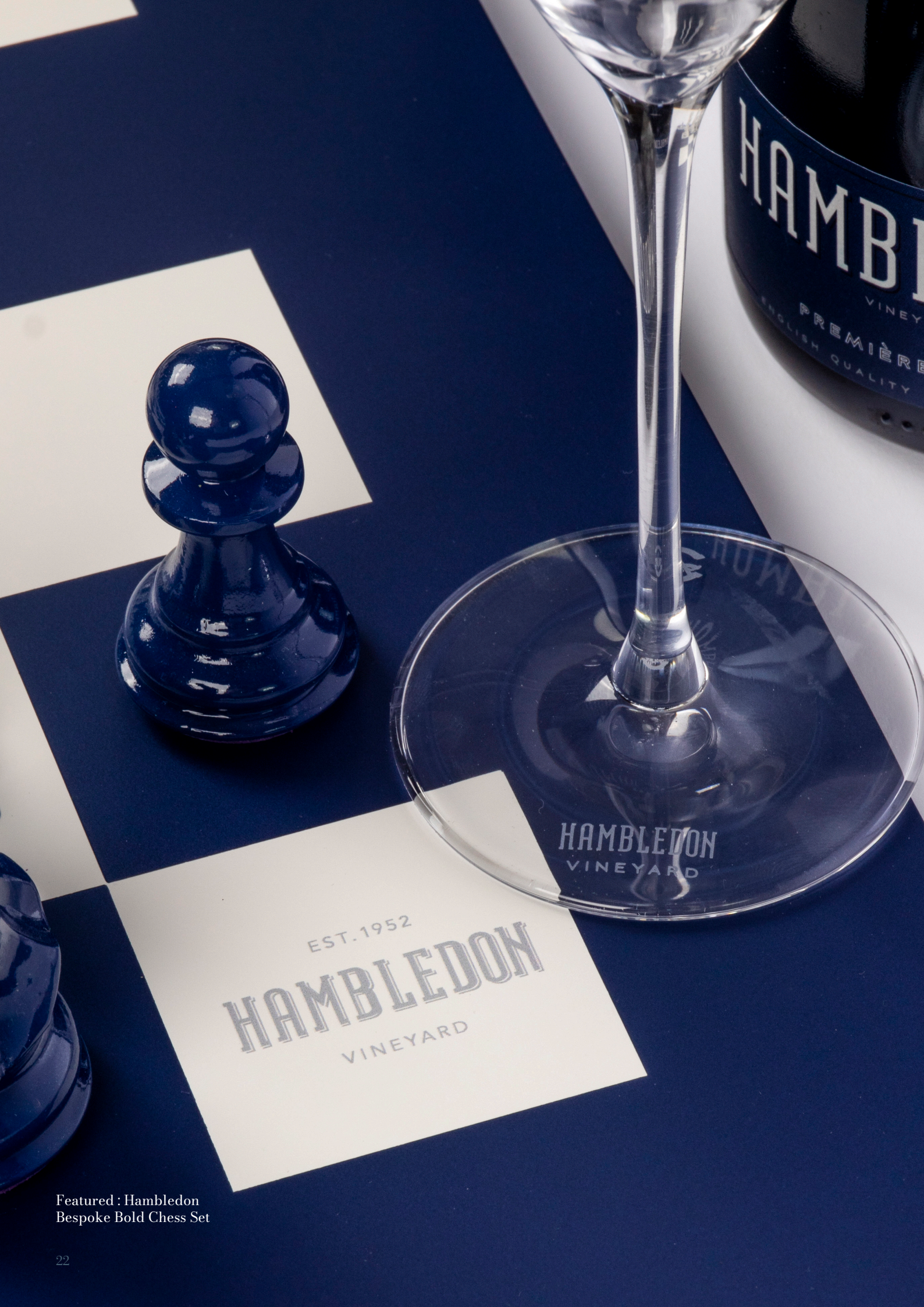
Featured : Hambledon Bespoke Bold Chess Set

In 2022, Purling was chosen by Hambledon Vineyard to collaborate and produce a bespoke Bold chess set, to celebrate its 70th Anniversary.