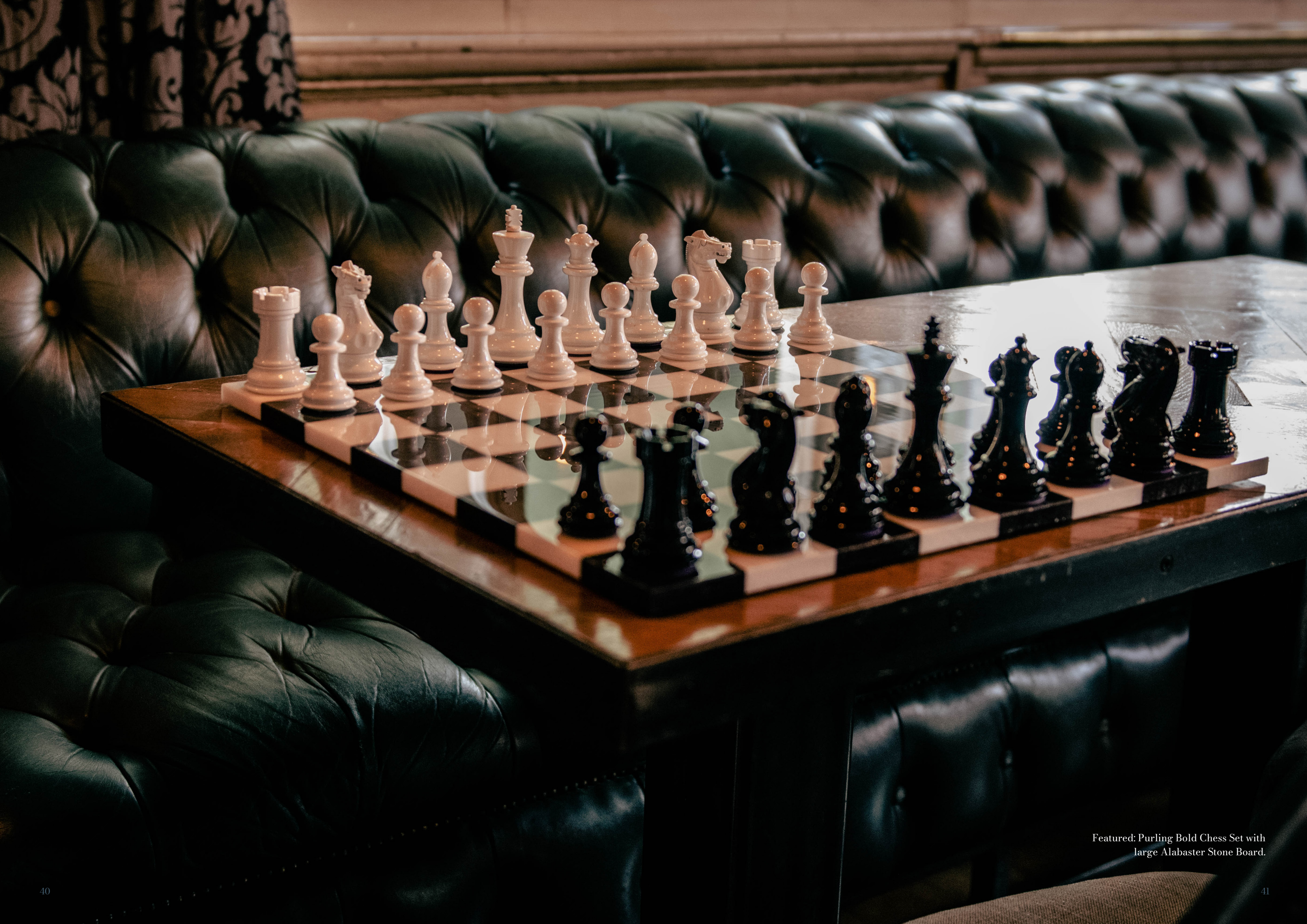
Featured: Purling Bold Chess Set with large Alabaster Stone Board.